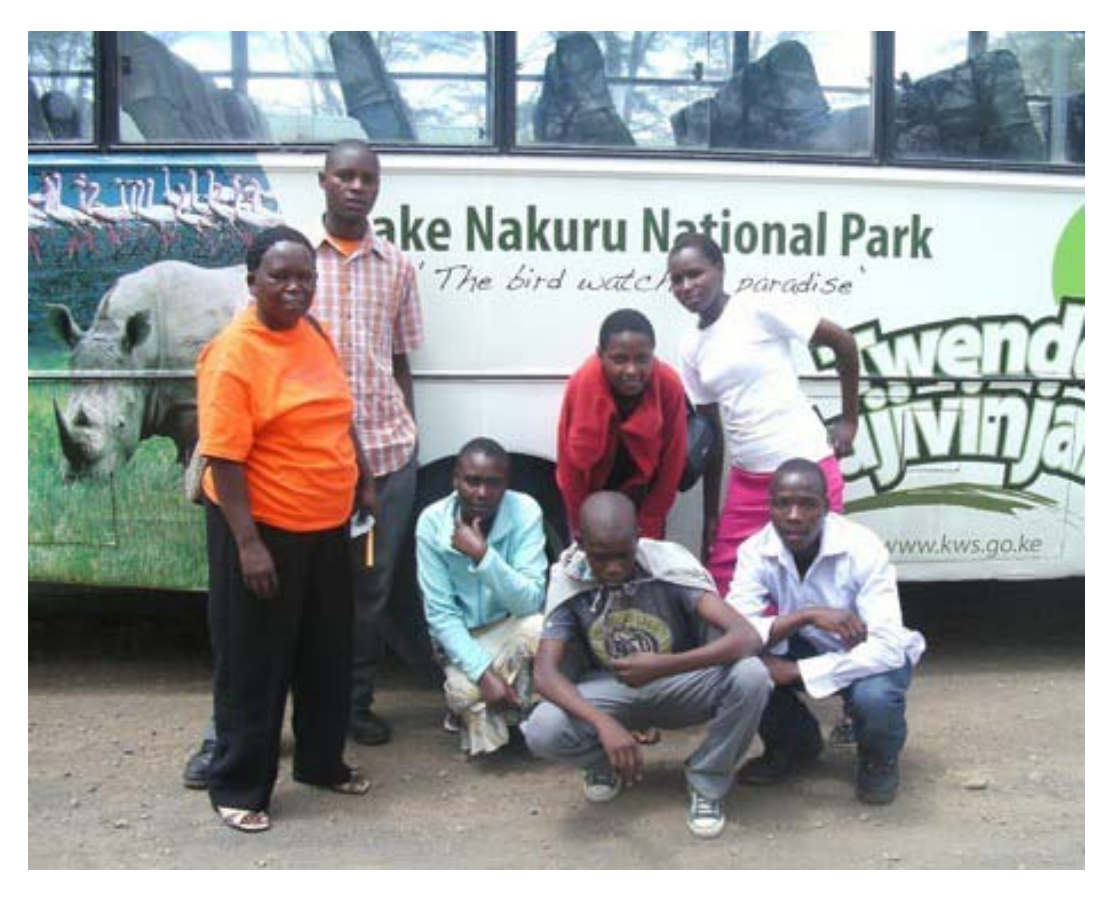
The 2012 seniors take a tour at Lake Nakuru National Park as part of a motivational weekend during their April school break. This is the first time they every left their home area.