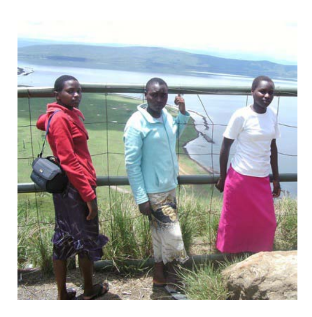
The girls enjoy the view of lake Nakuru