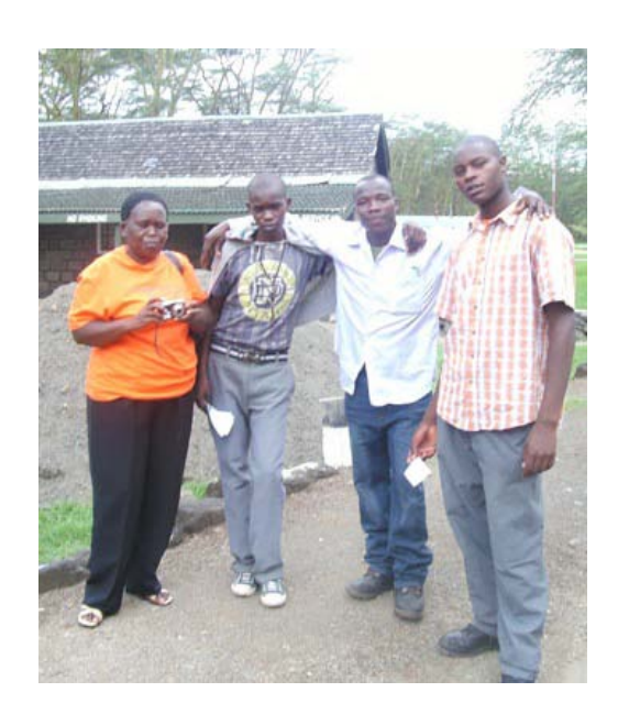
The boys share a moment with the Molo coordinator